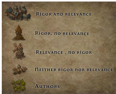
Fig. 2. Legend of the visual RET map.

evaluated through a case study and is used internally at the company.