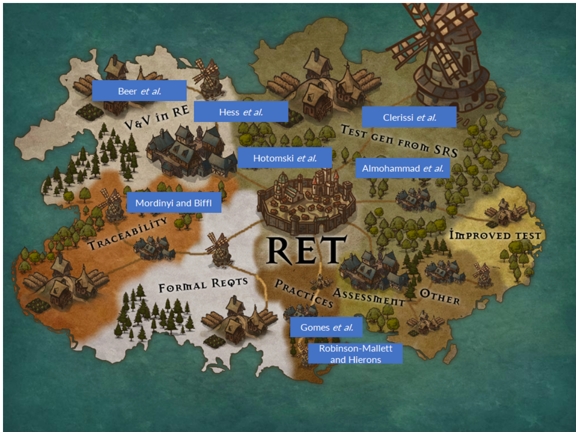
Fig. 1. A visual map of research on RET alignment.